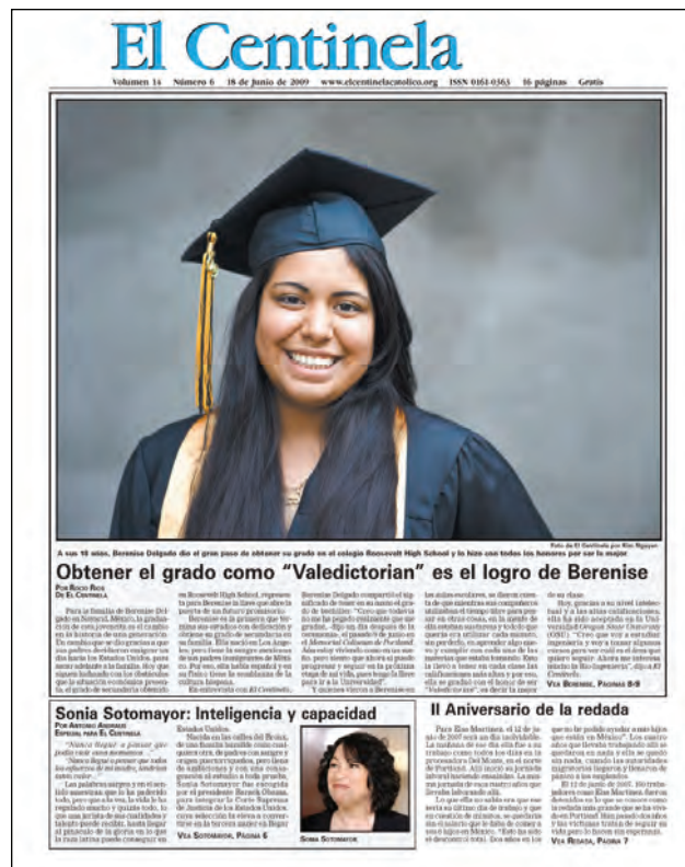
Award S1c, Best News Writing, National/International Event, First Place, El Centinela, Portland, Ore.