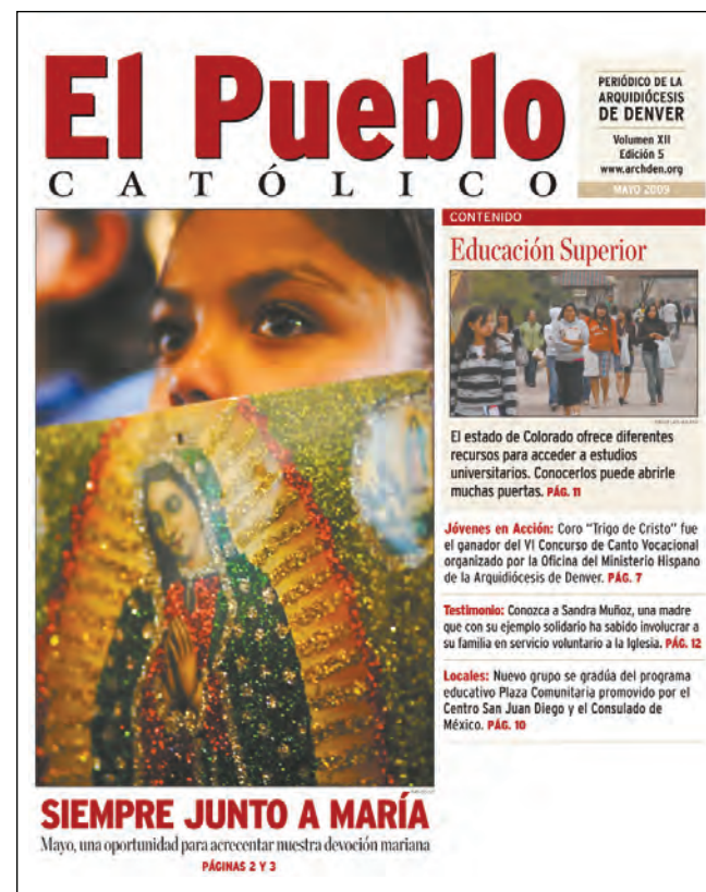
Award S6a, Best In-Depth Analysis, First Place, El Pueblo Catolico, Denver, Colo.

I was captivated by the sheer importance of this story for an immigrant community, which I would think is an important readership for the newspaper. It is above all a story that gives hope and inspiration to young people and their families by correcting some common myths, while not underestimating the challenges. It has very important implications for the future well-being and integration of